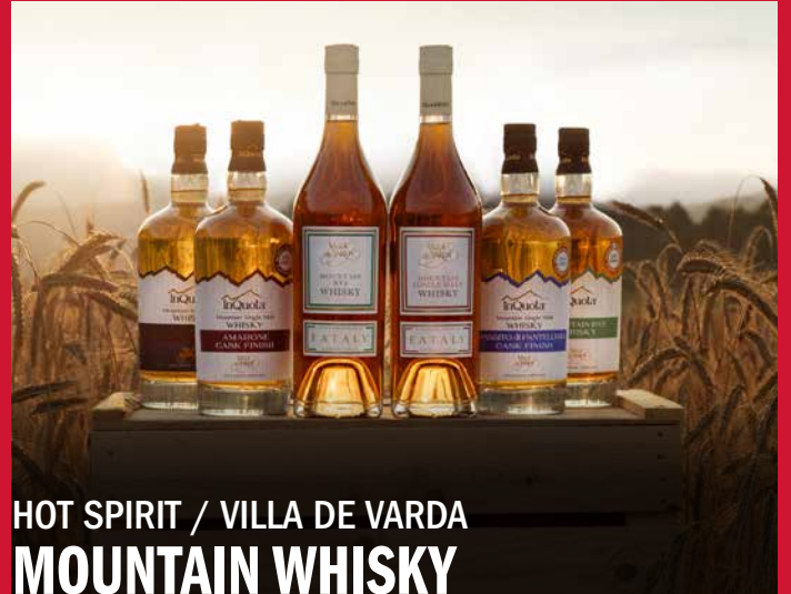
HOT SPIRIT / VILLA DE VARDA MOUNTAIN WHISKY