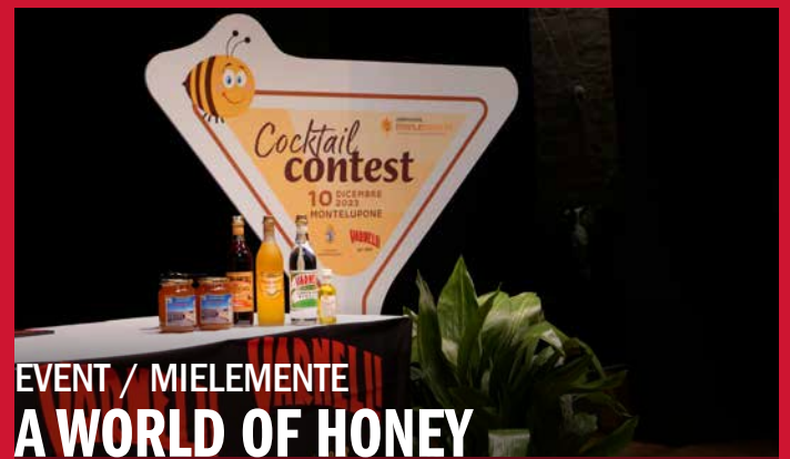
EVENT / MIELEMENTE A WORLD OF HONEY