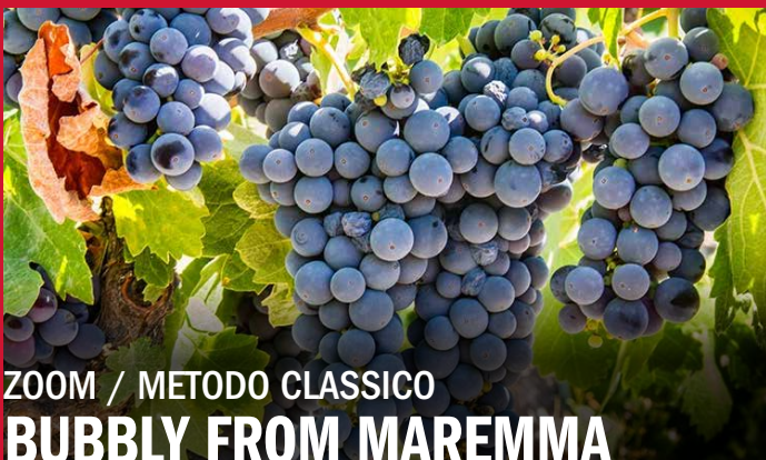
ZOOM / METODO CLASSICO BUBBLY FROM MAREMMA