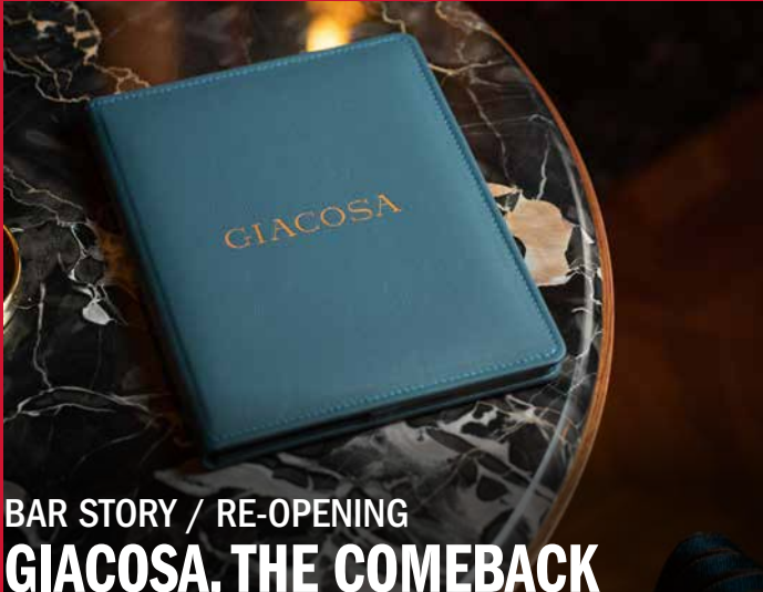
BAR STORY / RE-OPENING GIACOSA, THE COMEBACK