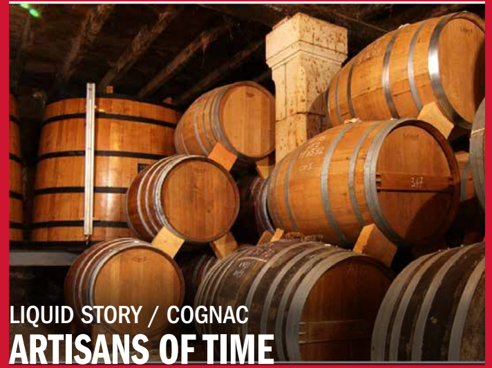
LIQUID STORY / COGNAC ARTISANS OF TIME