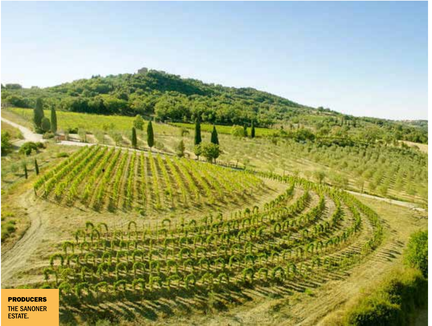
PRODUCERS THE SANONER ESTATE.