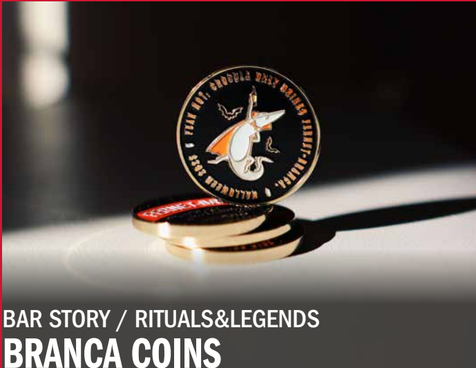
BAR STORY / RITUALS&LEGENDS BRANCA COINS